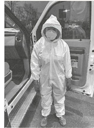
The 2020 look of Economy Ambulance Employees