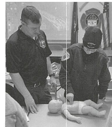
Economy Ambulance teaching our local Fire Departments CPR (early 2020)