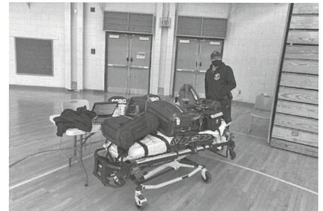
Economy Ambulance Employees standing-by at Vaccine Clinic