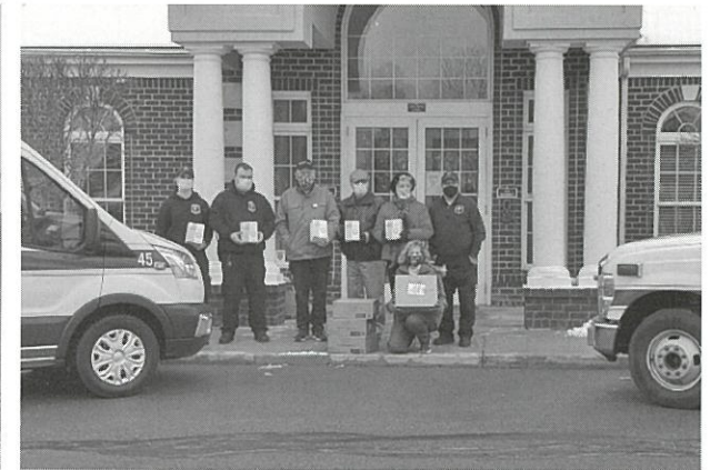
Mask Donation from our friends at Liberty Hills